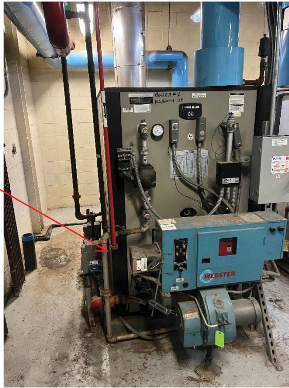
Photo No. 1 - U7 Grit and Screening Boiler No. 1