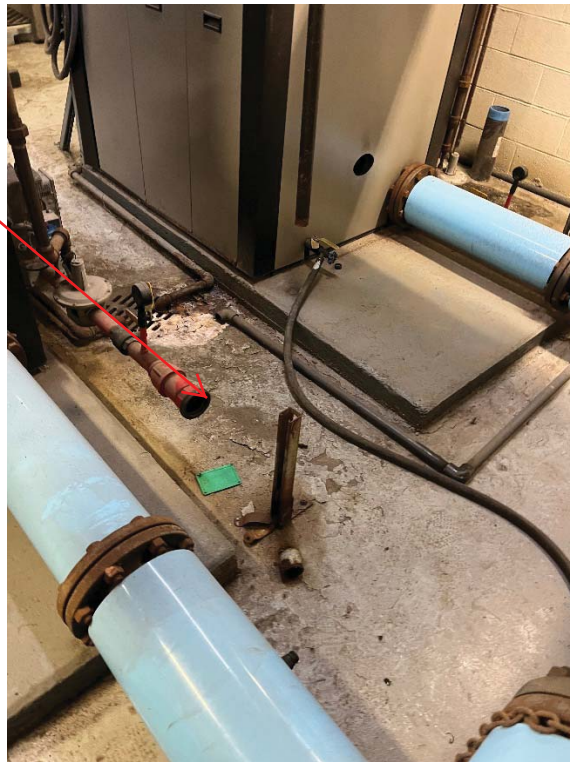
Photo No. 4 – U7 Grit and Screening Boiler No. 2 Disconnected Natural Gas Piping